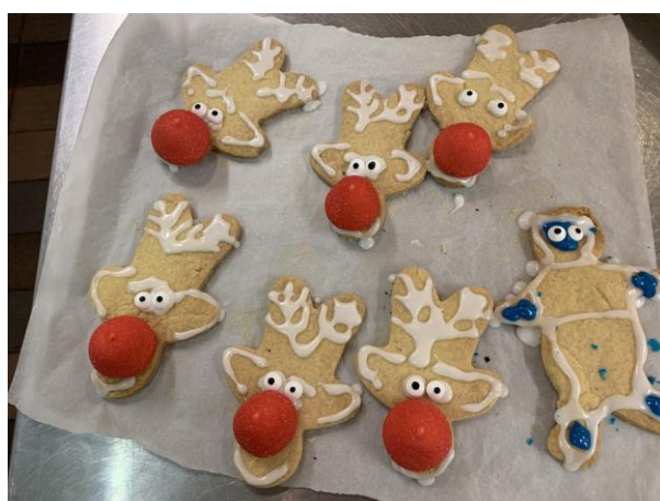
1 - The children made some lovely biscuits in club this week.

The children will be making fairy cakes in Cookery Club next week. Please remember to book your child in if you would like them to be involved. Thank you.