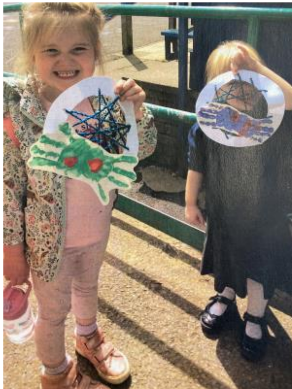
1 - We have had great fun this week learning about spiders! We threaded some wool to make a web and then made a spider using handprints.