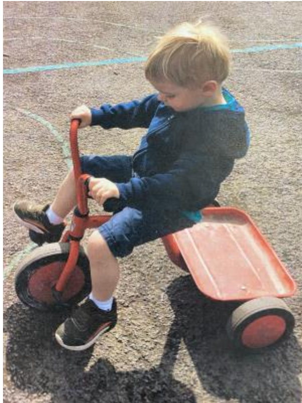
2 - We have also been learning how to pedal a trike!